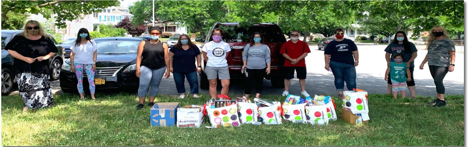
Above, the delivery team stands ready to deliver the kits. A closeup of the kits, at right, shows some of the items provided to the families.

A second round of Family Care Kits, containing games, materials for crafts, hygiene products and even some baking mixes for snacks were delivered to PMS families last week, thanks to the efforts of Poughkeepsie Middle School staff members. The kits were designed to give families something fun to do during isolation and provide needed supplies.