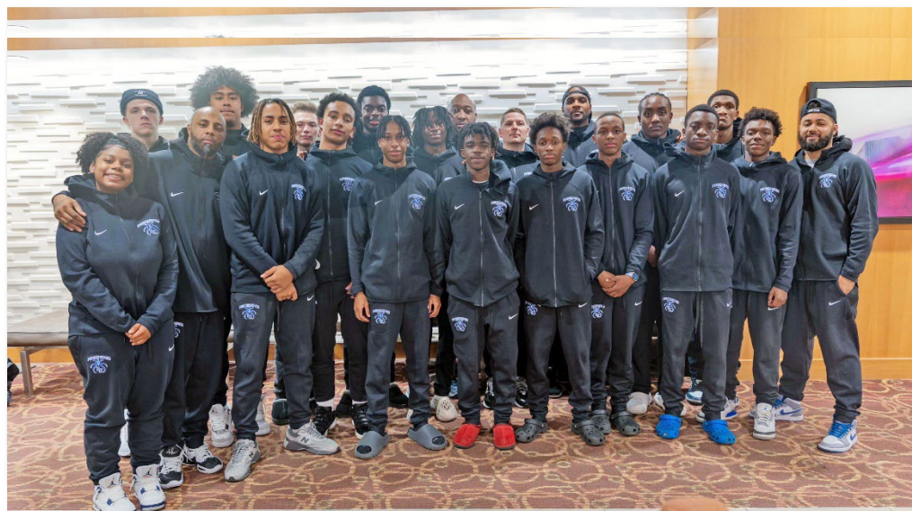
Poughkeepsie Pioneers boys' varsity basketball team finished second in the 40th annual REB Invitational Basketball Tournament in Edmonton, Alberta, Canada, Dec. 14-16.

The Poughkeepsie High School varsity boys' basketball team recently expanded their worldview, learning about Canadian culture, and the people representing the culture when they traveled to Edmonton, Alberta, Canada for the 40 th annual REB Invitational Basketball Tournament held Dec. 14-16.