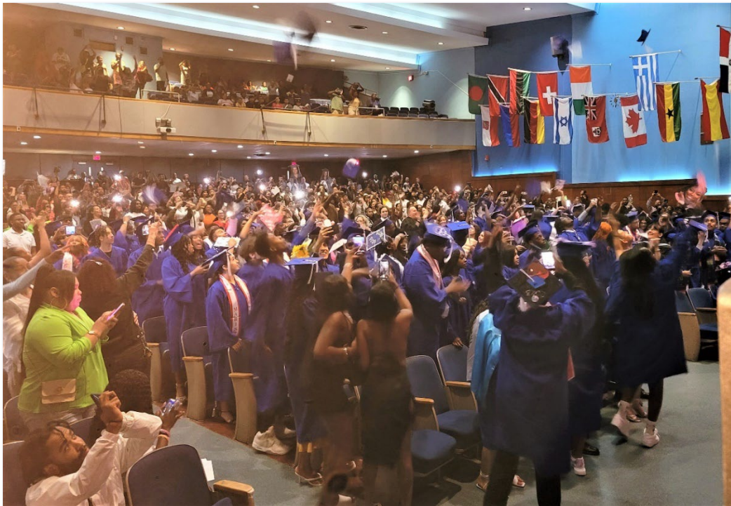
Members of Poughkeepsie High School's Class of 2023 toss caps in the air celebrating their graduation Friday, June 23, 2023. SEE MORE PHOTOS ONLINE HERE