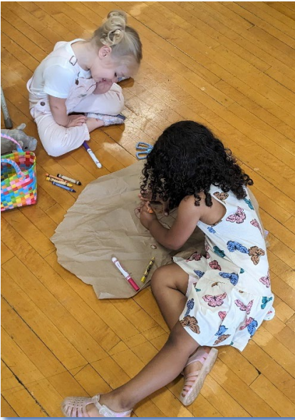
Children engage in an activity during Poughkeepsie Basics University Saturday, June 24, 2023, at the Early Learning Center.