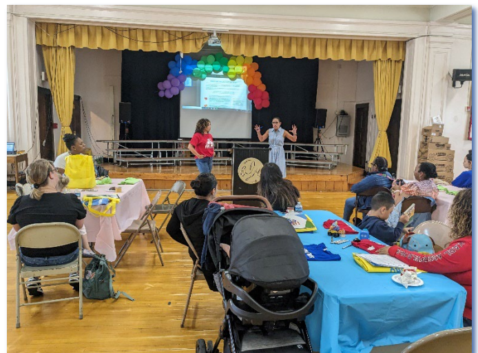
Poughkeepsie Basics University was a series of workshops and presentations designed to help parents prepare their children to start school. It took place Saturday, June 24, 2023 at the Early Learning Center.

The Poughkeepsie Basics University was developed to engage families of children aged 0-3 in conversation and activity that better prepares the soon-to-be Poughkeepsie City School District student to be school ready (see Poughkeepsie Children's Cabinet Report of Early Learning ). "As educators, we have an