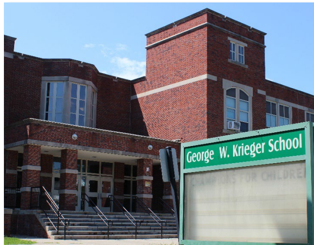
New visitor protocols will be in effect at all PCSD schools beginning Monday, June 13, 2022.