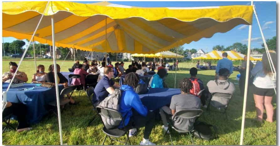
Student-athletes enjoy some social time during the Thursday, June 10,