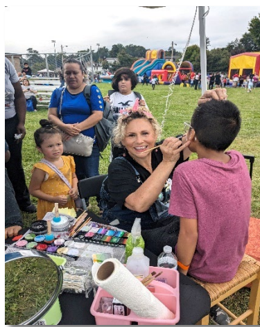
A face painter creates art for one of the young men in attendance.