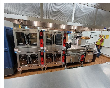
Clockwise from above: A Day Automation worker installs a new safety scanner at Poughkeepsie High School Wednesday, Aug. 30, 2023. A look inside a renovated restroom at PHS featuring new sinks, mirrors, stalls and toilets (not shown). The new ovens, stovetop and exhaust in the kitchen.