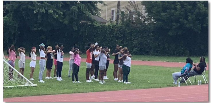
At left, the boys varsity football team gathers on the field during practice. Above, PHS cheerleaders warm up during an outdoor practice in August.