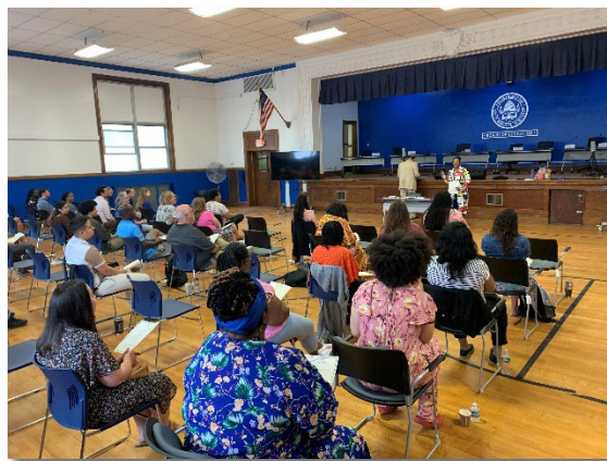
New employees listen to a presentation during orientation Aug. 29, 2023.