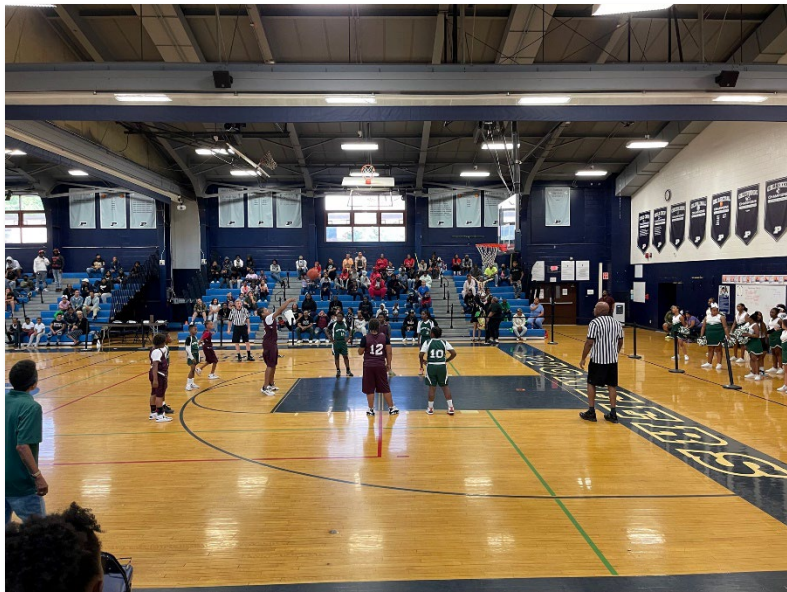
Krieger and Morse students watch a free throw.

The 2021-2022 Student Athletic Basketball Program (SABP) culminated yesterday evening with Krieger Elementary School victorious over Morse Elementary School in the SABP Championship game 26 – 14 at Poughkeepsie High School.