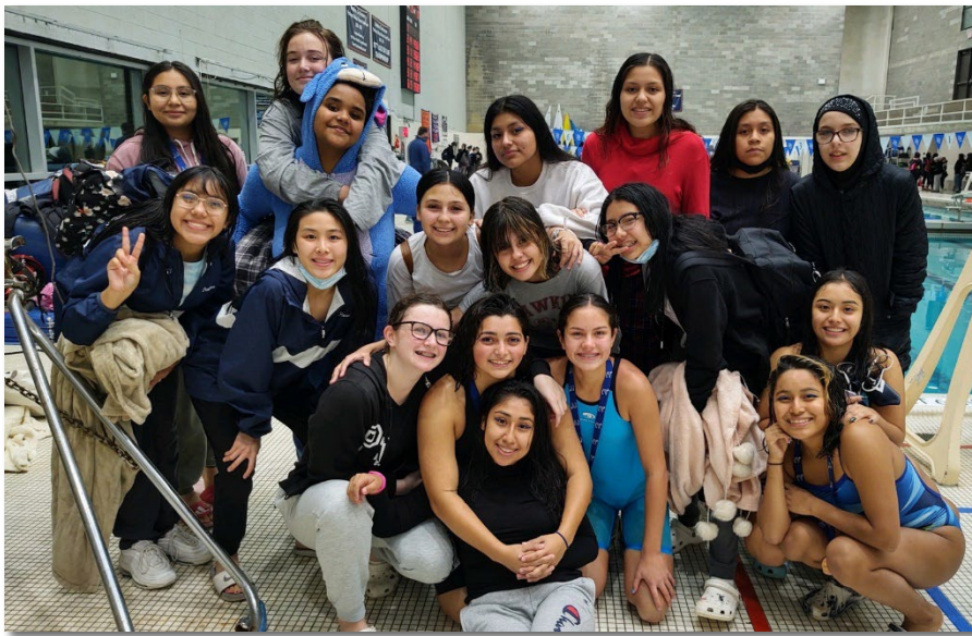
The girls swim team poses for a photo at the pool.

The Poughkeepsie girls swimming team is making waves in the pool and on the sidelines where they cheer on not only each other, but rival teams as well. This distinction earned them the Section I Good Sportsmanship award.