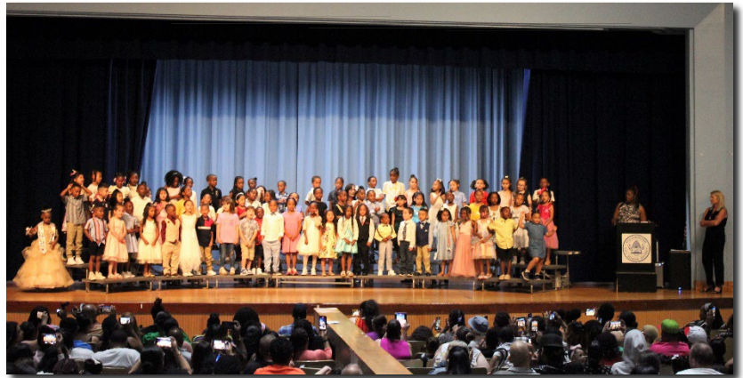
Students in four ELC kindergarten classes sing and dance as part of the first in a series of moving up ceremonies in the district.