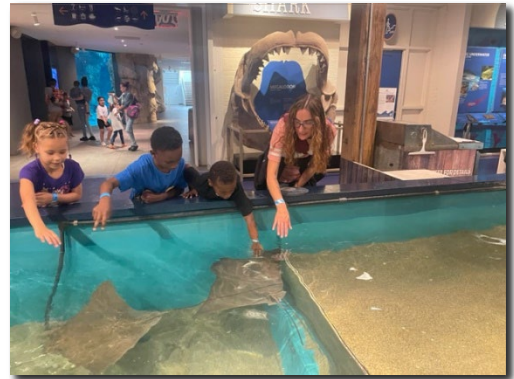
Morse Elementary students interact with rays at the aquarium.