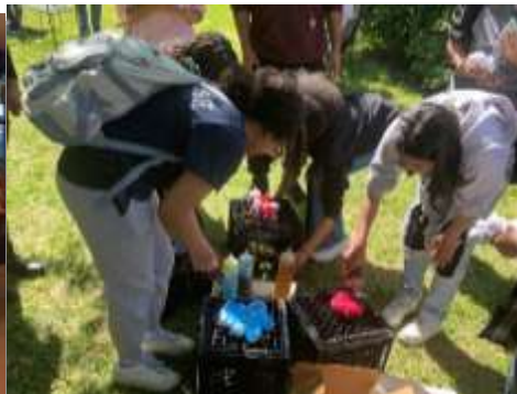
Top, PHS students and staff looking at the various art pieces on display at the art show. At left, some of the homemade ceramic lamps on display. At right, students making tie-dye shirts.

the winners of the Art Excellence Awards presented to students during the show and felt a sense of pride when accepting it.