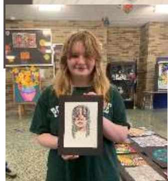
Top Left, Hand drawn student portrait (student artist holding her art). Middle, student pottery. Top Left Right, student collage. Right, various paintings.