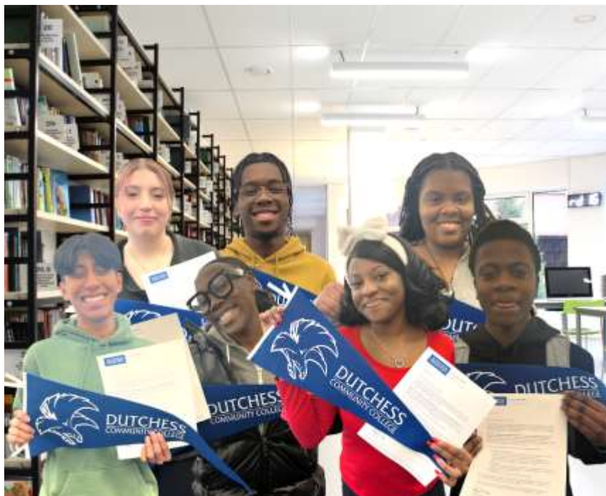
Seven of the 25 PHS students who were instantly admitted to DCC Feb. 1, 2023.