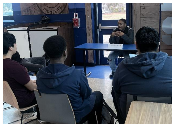
Students rotated to stations talking to different alumni in a new format for the annual event that led to more engaging discussions.