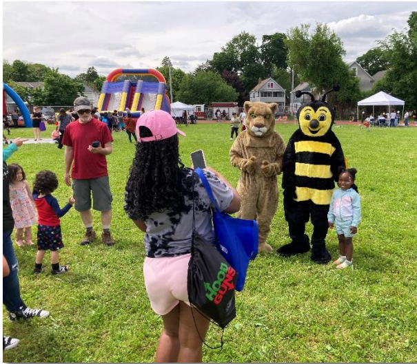
Last year's spring festival featured inflatable slides, face painting and mascots.